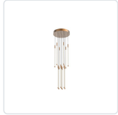
MP75121-BG Brushed Gold