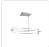
LP16236-BN Brushed Nickel