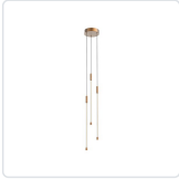
MP75221-BG Brushed Gold