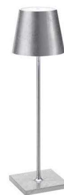
LD0340BFA* Silver Leaf (hand applied)