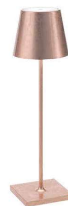
LD0340RFR* Copper Leaf (hand applied)