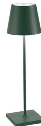
LD0340M4 Dark Green