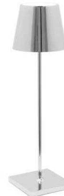
LD0340C4* Glossy Chrome