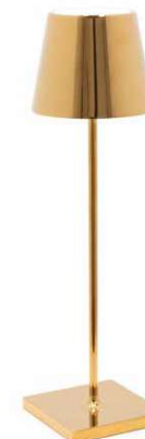
LD0340O4* Glossy Gold