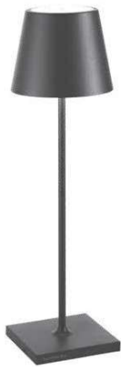
LD0340N4 Dark Grey