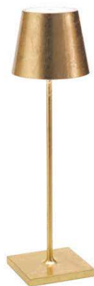
LD0340BFO* Gold Leaf (hand applied)