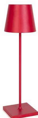
LD0340U4 Ruby Red