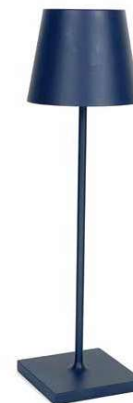
LD0340Y4 Steel Blue