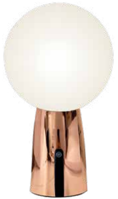
LD0900E3* Glossy Copper

*Lamps with Glossy Gold, Glossy Chrome, and Glossy Copper finishes are not suitable for outdoor use