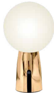
LD090003* Glossy Gold