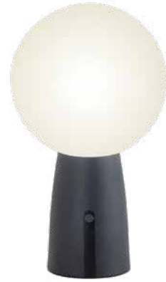
LD0900N3 Dark Grey