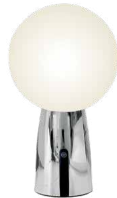
LD0900C3* Glossy Chrome