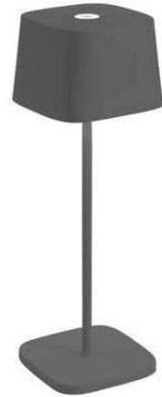
LD0870N4 Dark Grey