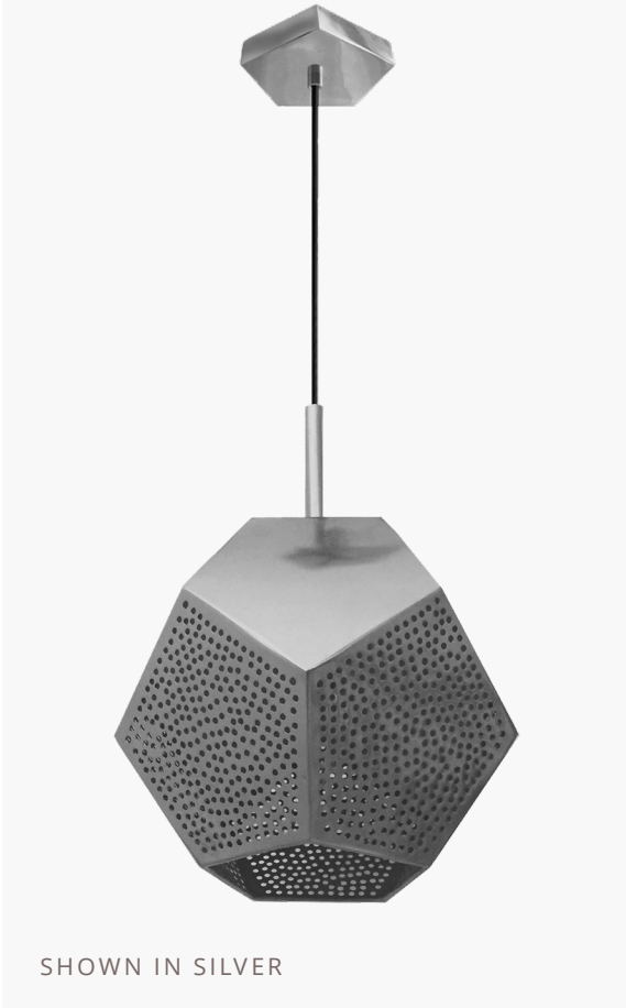
SHOWN IN SILVER

The Ula Pendant offers an intriguing, geometric design featuring a polished metal hexagonal shade. This stunning bold and angular light fixture combines geometry and intricate Moroccan craftsmanship. Designed in the USA and handmade to perfection in Morocco.