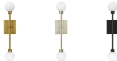
White/Aged Brass White/Satin Nickel White/Matte Black

Includes (2) 120 volt 8.7 watt (16.8 total watts) 937 total delivered lumens 90 CRI 2700K LED module. Dimmable with most LED compatible ELV and TRIAC dimmers. 277V compatible with 0-10V dimmers. Mounts up or down.