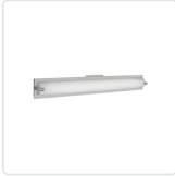
601001BN-LED Brushed Nickel