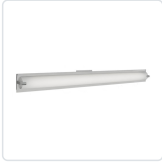
601002BN-LED Brushed Nickel