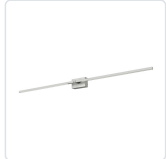
WS25350-BN Brushed Nickel