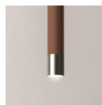
12 rust brown wrinkled final black polished nickel