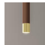
13 rust brown wrinkled final polished gold