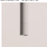
07 matt white RAL 9016