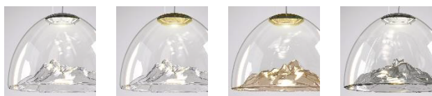
CS / CR Crystal / chrome CS / OR Crystal / gold AM / OR Amber / gold GR / CR Grey / chrome

Considering the craftsmanlike manufacturing of the product and the special finishing process, always by hand, you may find different appearances and shades between one product and another and they are to consider as absolute distinction of the item.