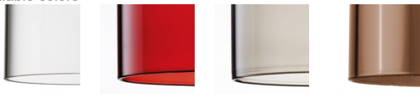
CS Crystal RS Red GR Grey BR Metallic bronze

USSPILL3 __ CR__ CUSTOMER _____ NOTES _____