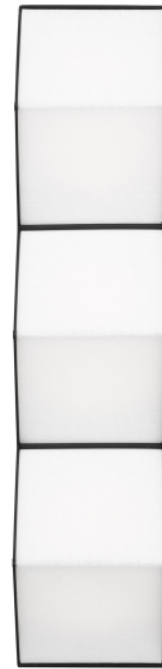
White Linen/Nightshade Black

Includes 18.3 watt, 625 delivered lumens, 2700K LED module. Dimmable with most LED compatible ELV, TRIAC dimmers. Mounts horizontally or vertically. 120V.