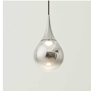
layered chrome glass + chrome cap