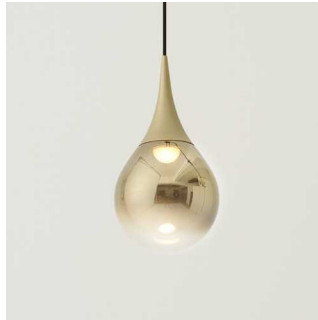
layered gold glass + champagne gold cap