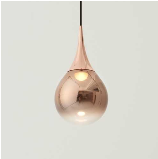
layered copper glass + copper cap