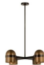
Blackened Bronze / Bright Worn Brass