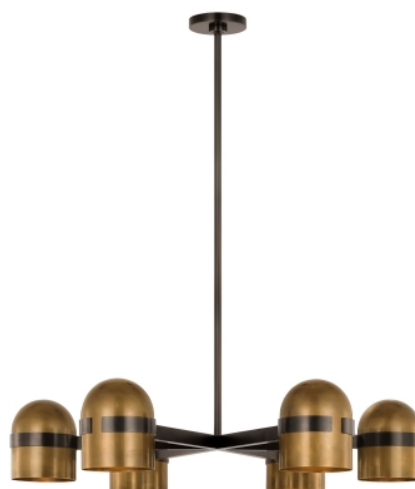
Blackened Bronze / Bright Worn Brass

Includes 26.6 watt, 1064 total delivered lumens, 90 CRI 2700K LED modules. Dimmable with most LED compatible ELV, TRIAC and 0-10V dimmers. Ships with 4-12" and 2-6" rigid stems. 120V-277V. Sloped ceiling compatible 22.5°.