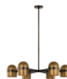
Blackened Bronze / Bright Worn Brass