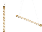
IMAGE SHOWS Satin gold with cristallo pearl beads