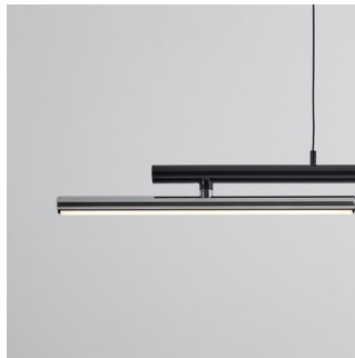
chrome + shiny black