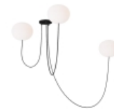
Matte Black with Etched White Glass