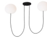
Matte Black with Etched White Glass