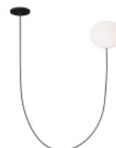
Matte Black with Etched White Glass