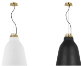
Matte White/Natural Brass Nightshade Black/Natural Brass