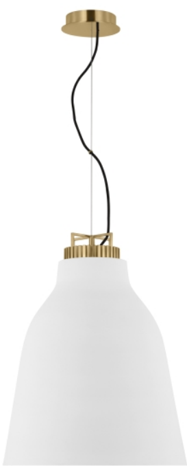
Matte White/Natural Brass

Includes 19 watts, 585 total delivered lumens, 2700K LED module. Dimmable with most LED compatible ELV, TRIAC and 0-10V dimmers. Ships with 14 feet of field-cuttable black cloth cord. 120V-277V.