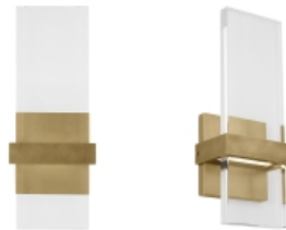
Clear/Natural Brass Clear/Natural Brass (Alt)