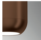
BR Matt bronze