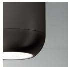
NI Matt nickel

EELc (Energy Efficiency Label compatibility) contain built in LED lamps that cannot be changed: A, A+, A++