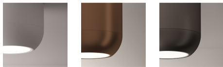
BC Wrinkled white