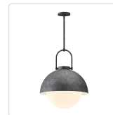
PD507216SLOP Steel Shade/Opal Matte Glass