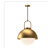
PD507216AGOP Aged Gold/Opal Matte Glass

*For complete warranty terms, please visit: www.aloralighting.com/warranty