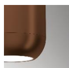
BR Matt bronze