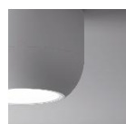
BC Wrinkled white