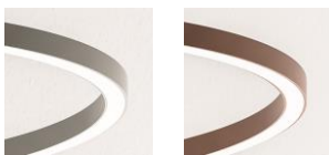
AN Anthracite grey