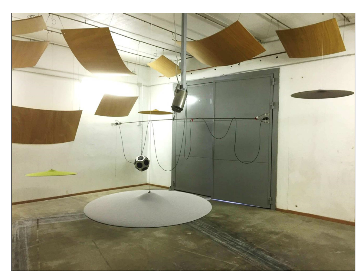
Photograph of the item

The item is manufactured by the customer and it was placed in the reverberation room by Istituto Giordano staff.