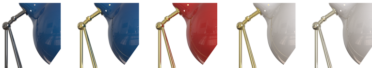
BlackNickel & Blue

1x E27 (bulbs not included for North America)