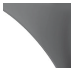
AN Anthracite grey