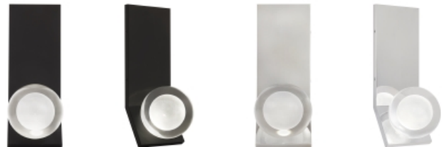
Nightshade Black Nightshade Black 3/4 Polished Nickel Polished Nickel 3/4

To view all available finish options, please visit techlighting.com