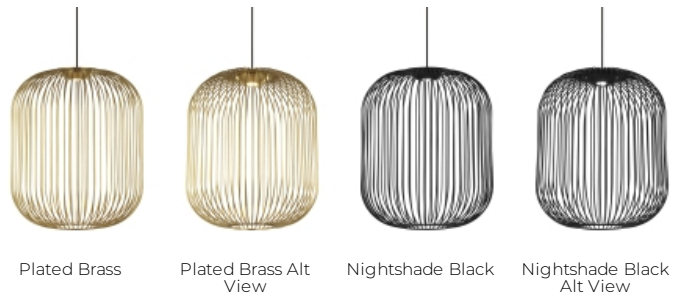
Plated Brass Alt View

Includes 120V 12.5 watts, 638 delivered lumens, 3000K LED module. Dimmable with most LED compatible ELV and TRIAC dimmers. Ships with 12 feet of field-cuttable black cloth cord. 120V