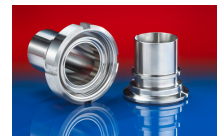
CONNECT ASEPTIC FITTING 249