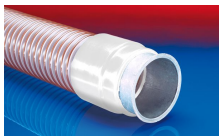
CONNECT 243 FOOD