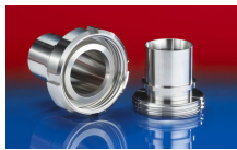
CONNECT DAIRY FITTING 247