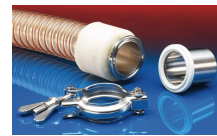
CONNECT TRI- CLAMP FITTING 245