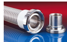
CONNECT MOULD ASSEMBLY 233