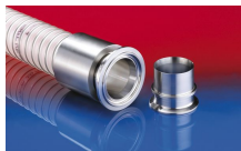
CONNECT PRESS ASSEMBLY 232