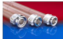
CONNECT SAFETY CLAMP ASSEMBLY 231