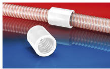
CONNECT 246 FOOD