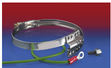
CLAMP 212 EC