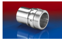
CONNECT THREAD FITTING 234