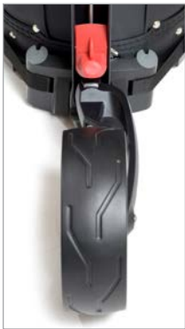
Fig. 39 Front wheel

Remove the front wheel by holding the buggy securely and pulling it out of the front wheel housing [figs 39 – 41].