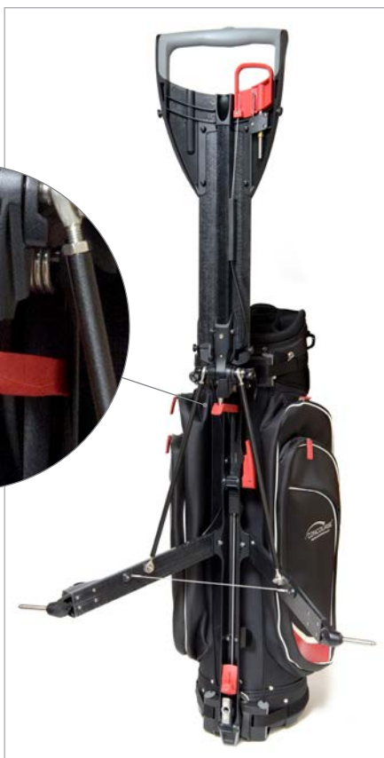
Fig. 13 Handle locked in place