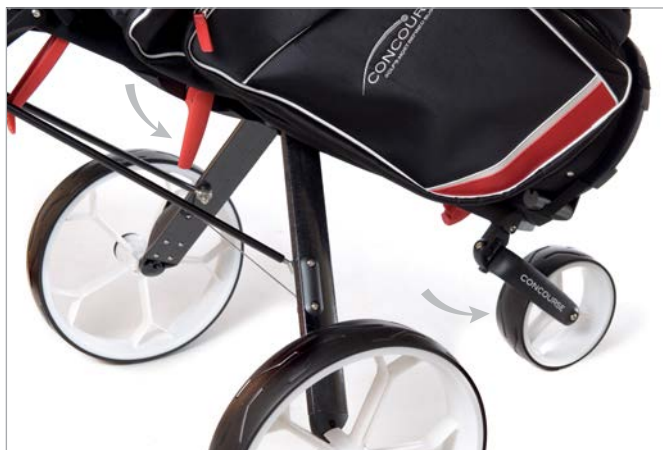
Fig. 21 Front wheel extending