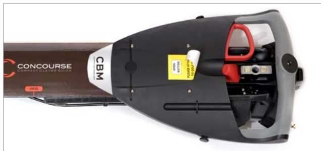
Fig. 2 Slowly peel sticker off