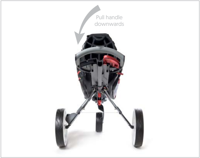
Fig. 19 Buggy resting on all 3 wheels

To set the front wheel, pull down on the handle and allow the buggy to sit on all 3 wheels [fig 19]