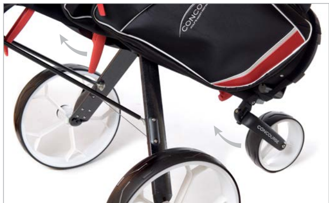
Fig. 33 Front wheel retracting