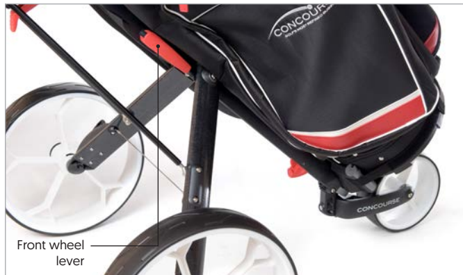
Fig. 32 Front wheel lever

Fold up the front wheel by pulling the red lever outwards to unlock, and then turn the lever towards the back of the buggy (fig 33) until the front wheel is fully retracted and the red lever is locked in the backward position. (fig 34).