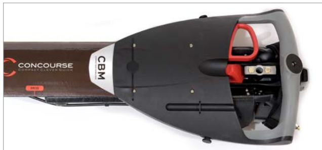
Fig. 3 Sticker peeled off

Open and unpack the box. Laying the contents out on a flat surface, this is what you will see. [fig. 1]