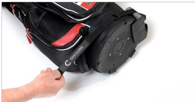
Fig. 8 Pull strap tight