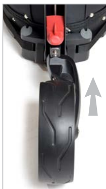
Fig. 15 Front wheel