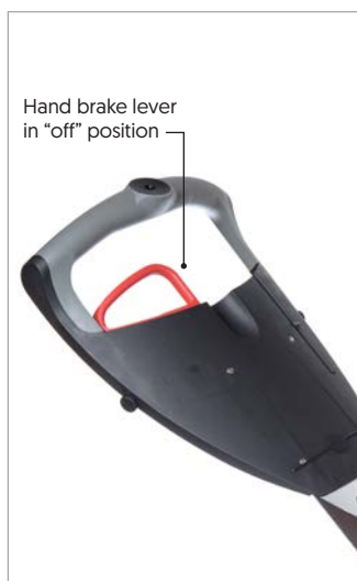
Fig. 26 Hand brake lever (off)