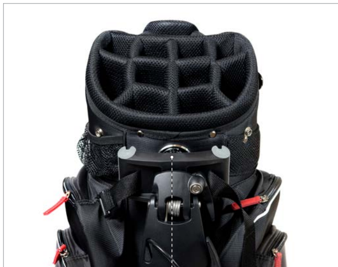
Fig. 10 Top bag support