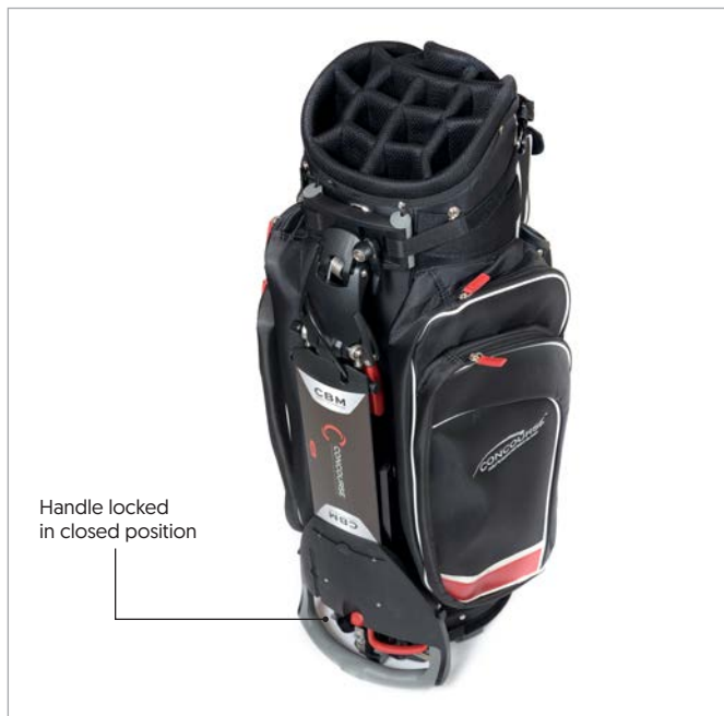
Fig. 44 Handle locked

Continue to fold the handle down until it clicks into the locked position. [fig. 44].