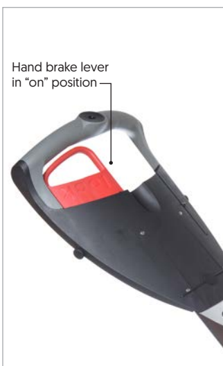
Fig. 27 Hand brake lever (on)