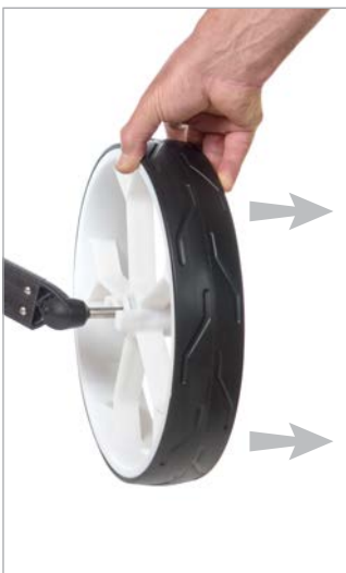
Fig. 38 Removing rear wheels

To remove the wheels, lift handle upwards and allow the buggy to sit on its base [fig 36] .