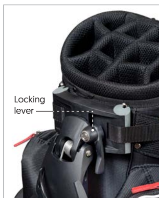
Fig. 28 Locking lever