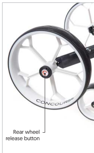
Fig. 37 Rear wheel release button