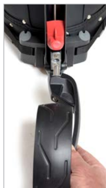
Fig. 14 Front wheel