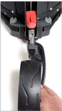
Fig. 41 Front wheel

To fold down the handle, press downwards on the red unlock arm [fig 42] and pull the handle away from the bag to begin folding.