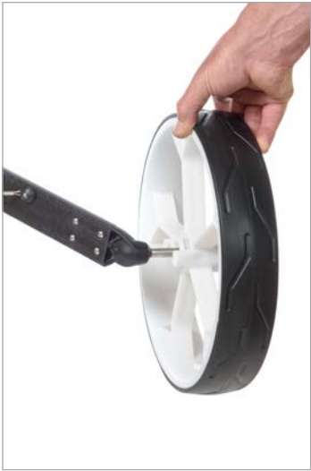
Fig. 17 Rear wheel

To fit the rear wheels hold the buggy securely and slide both rear wheels onto the axles until they click into place. [figs 17 & 18].