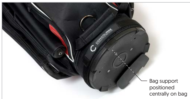
Fig. 9 Fastened bag support