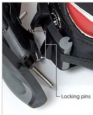
Fig. 30 Locking pins