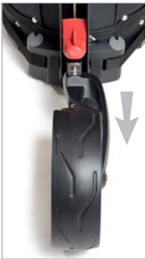
Fig. 40 Front wheel