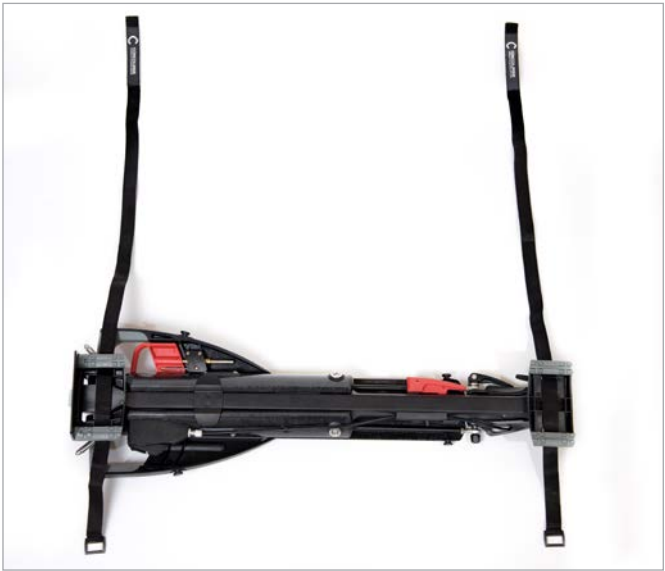
Fig. 5 Unravel bag support straps

Remove the lower bag support and strap from the buggy assembly and place on the base at the rear of the golf bag with the strap around bag base and passing through the plastic buckle. [fig 6 & 7].