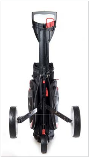
Fig. 18 Rear wheels in place

To set the front wheel, pull down on the handle and allow the buggy to sit on all 3 wheels [fig 19]