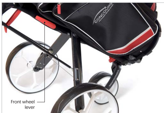
Fig. 20 Front wheel lever