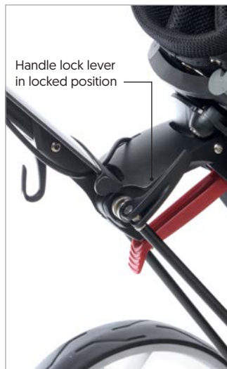
Fig. 23 Handle lock lever (locked)

On the lower section of the handle is the handle lock lever. To adjust the handle height, pull down on the lever to unlock the handle. [figs 23 & 24].