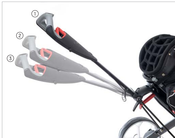
Fig. 25 Handle heights

Note: You can leave the handle height in your preferred position and the buggy will still fold up normally. There is no need to keep adjusting the handle position each time you unfold and fold up the buggy.