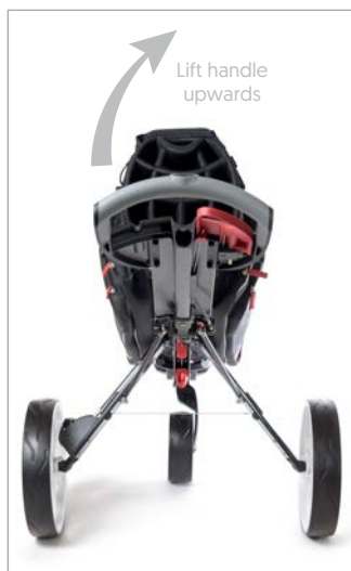
Fig. 35 Lift handle up