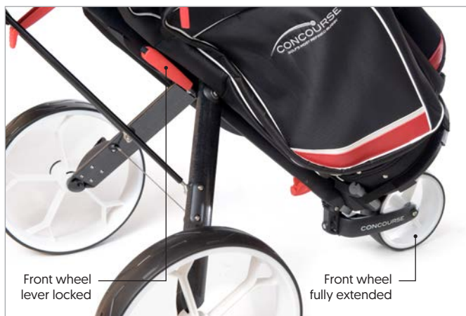
Fig. 22 Front wheel fully extended

To lock front wheel into position, locate the red lever on the side of the main buggy frame [fig 20] .