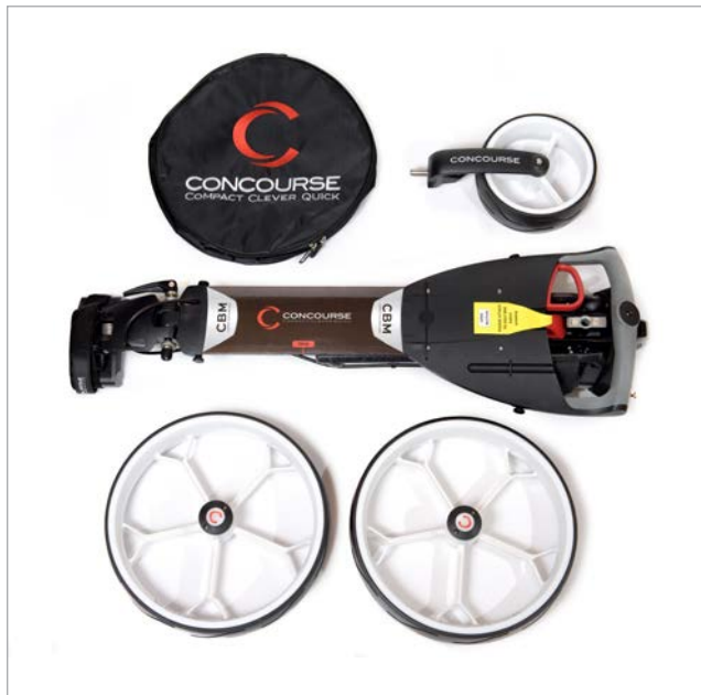
Fig. 1 Contents of box