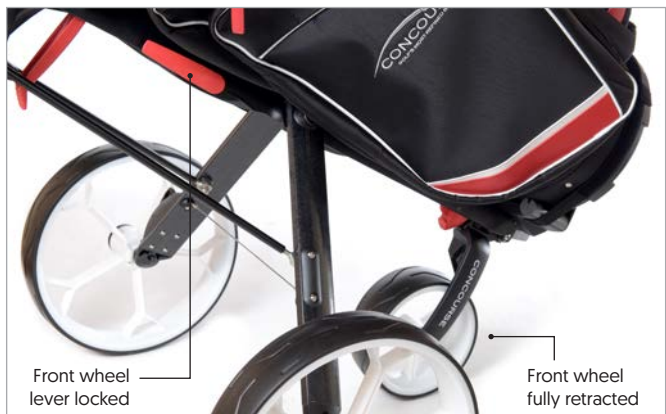
Fig. 34 Front wheel fully retracted