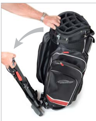
Fig. 29 Separating from bag