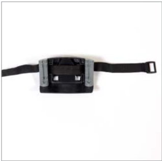
Fig. 6 Lower bag support

Remove the lower bag support and strap from the buggy assembly and place on the base at the rear of the golf bag with the strap around bag base and passing through the plastic buckle. [fig 6 & 7].