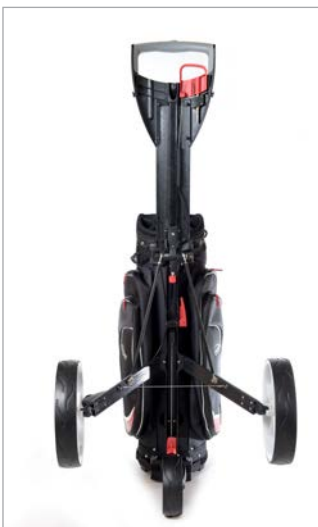
Fig. 36 Buggy resting on base