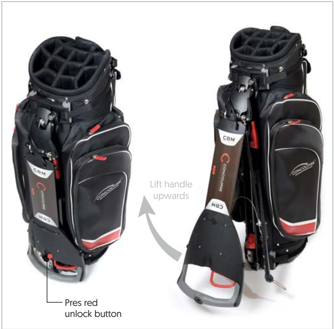
Fig. 12 Unfold handle

To unfold, hold the buggy securely and press the red unlock button situated on the top handle of the buggy [fig. 13] . Then lift the top handle upwards and the buggy will begin to unfold. [fig 14] .