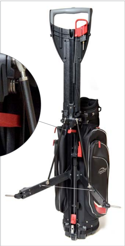
Fig. 42 Unlocking arm