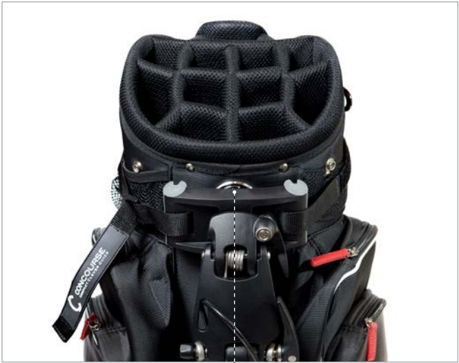
Fig. 11 Top bag support strap

Note: Once the top bag strap is tightened, you must ensure that the top bag support is still positioned centrally on the golf bag.