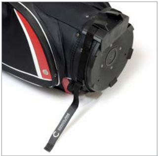
Fig. 7 Strap around base and through buckle