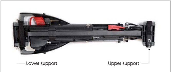
Fig. 4 Locate upper and lower bag supports

Lay the buggy assembly on a bench or table and unravel the straps. [fig 4 & 5].