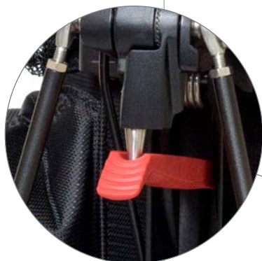
Fully locked position