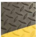
Black with yellow border