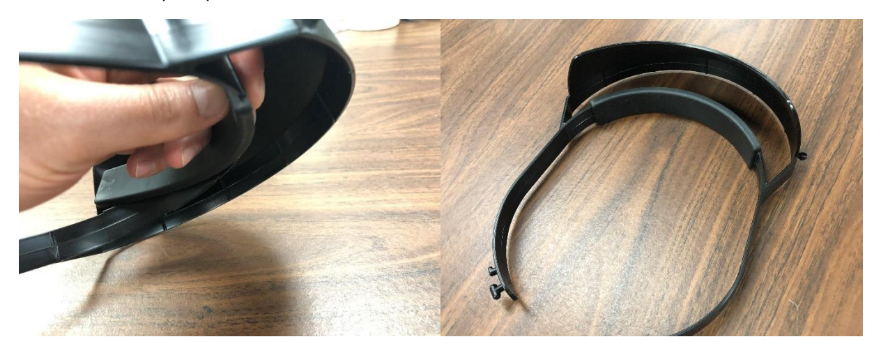
The strap attaches permanently to two hooks and is adjusted using a single hook as shown: