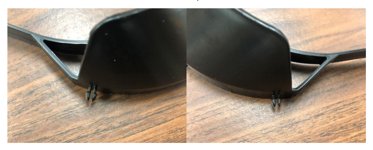
The forehead strip snaps onto the headband as shown:

The clear shield attaches to the headband via two snap features shown below: