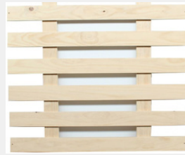
1 x Pack of bed slats ( 2 gates)