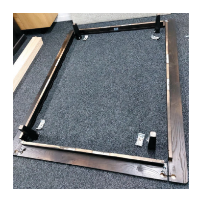
Step 4 Bolt legs in place using the 13mm spanner.

Sit frame together upside down using the 2 x side rails and 2 x end rails. Ensure the 4 insert nuts on the rails for the headboard to bolt into are all the same end.