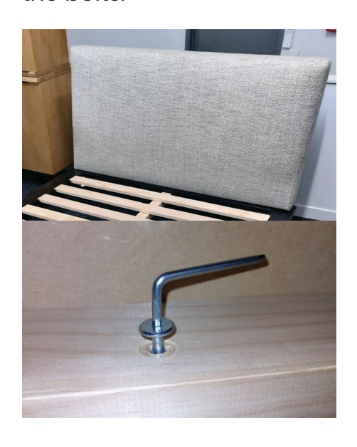
That's it, you're done!

Sit headend in place and bolt to the frame using the 50mm JC Bolts. The bolts go down through the bottom of the headend and into the frame from the back. You will need someone to hold this in place while doing up the bolts.