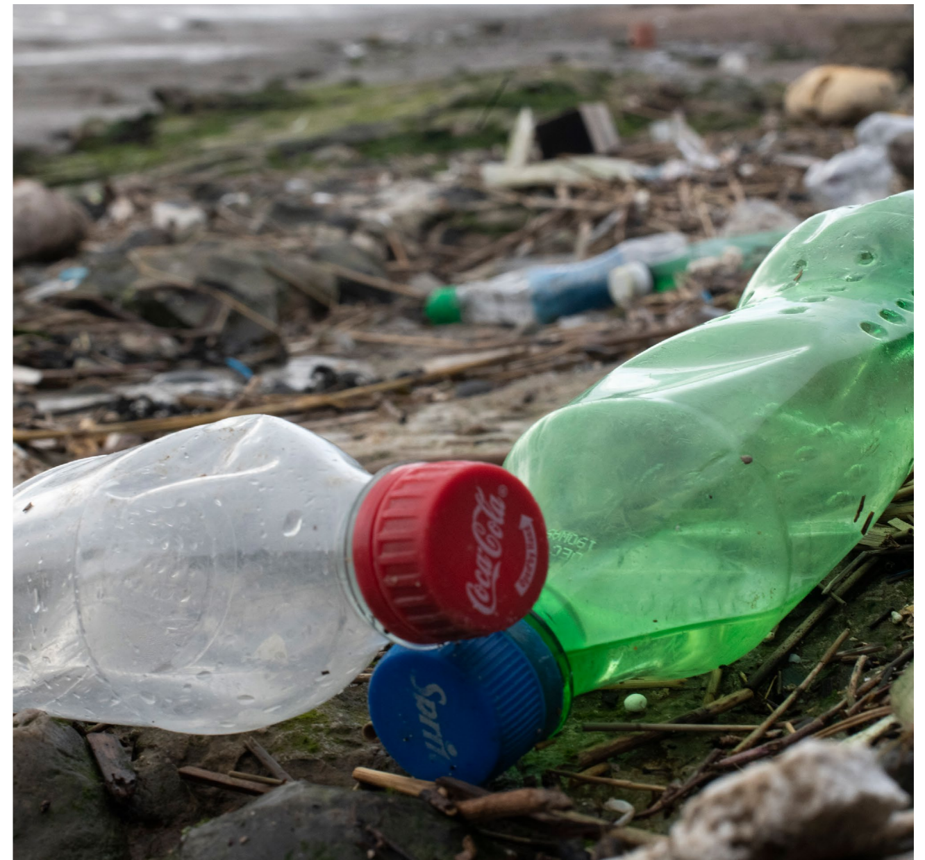
Coca-Cola plastic pollution in the environment

Coca-Cola also commits to using at least 50% recycled material in its packaging by 2030. 13 Currently, the company reports that recycled content makes up 10% of its total plastic-packaging volume. 14,15 However, Coca-Cola has had targets on minimum recycled content in bottles as far back as 1990, and, so far, has failed to meet them. In its 2008/9 Sustainability Review, the company's target for rPET in their bottles was 25% by 2015; no progress towards the goal was mentioned. 16 In its 2010/11 Sustainability Report, the company maintained its goal of 25% but redefined the target to 'recycled or renewable' content by 2015. The 2014/15 report claims Coca-Cola used 12.5% recycled or renewable content, but its 2016 Sustainability Report does not even mention the goal. Today, some of the company's brands are sold in bottles made with rPET, but it is unclear how Coca-Cola plans to achieve its new target of 50% recycled material across all its packaging by 2030 - or whether it simply intends to shift the goalposts again.