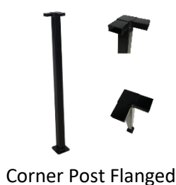
Corner Post Flanged