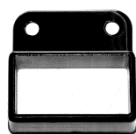
50 x 25mm Panel Bracket (Top Rail)