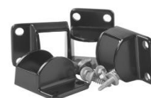
38 x 25mm Panel Bracket (Bottom Rail)