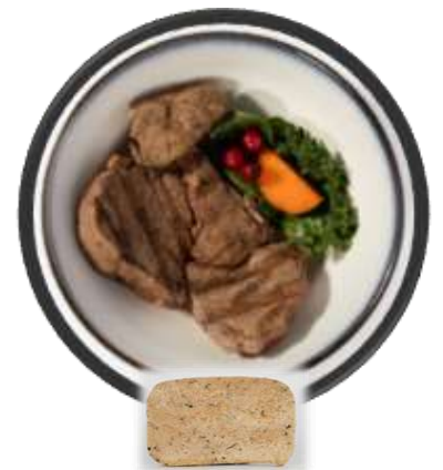
Portion-control food bars convenient for thawing and feeding