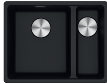
MRG660-34/15 SBR ON