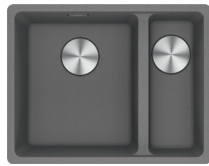
MRG660-34/15 SBR SG