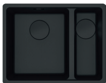
MRG260-3 4/15 SBR MB