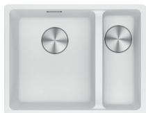
MRG260-34/15 SBR PW