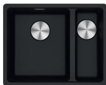
MRG260-34/15 SBR ON