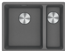
MRG260-34/15 SBR SG