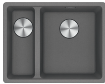
MRG260-34/15 SBL SG