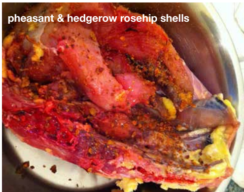
pheasant & hedgerow rosehip shells

generally become smaller and better formed as they utilise more of the food that they are being fed. The perfect poo can vary in colour but should be like a small kickable non stick pellet.