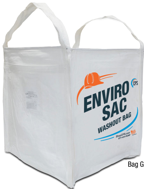
Bag Graphics Will Vary