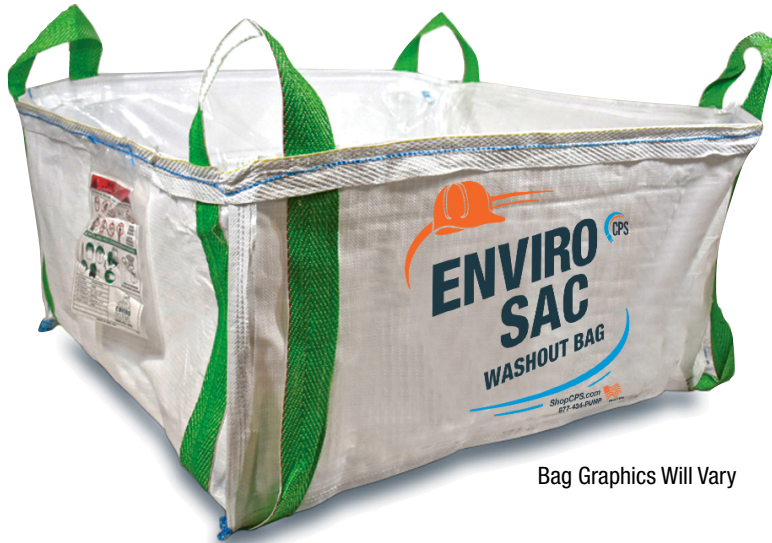
Bag Graphics Will Vary